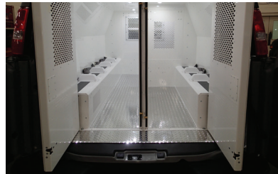
Powder coat finish for durability and easy cleaning