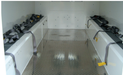
Seat belts, dividers and grab straps for each seat