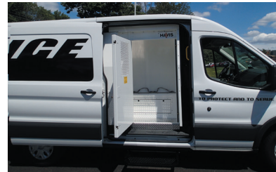
Heavy-duty doors that lock on closing