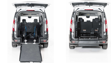
Accommodates 5 adults and 1 wheelchair passenger compared to the most standard end-user market option of 4 adults and 1 wheelchair layout.