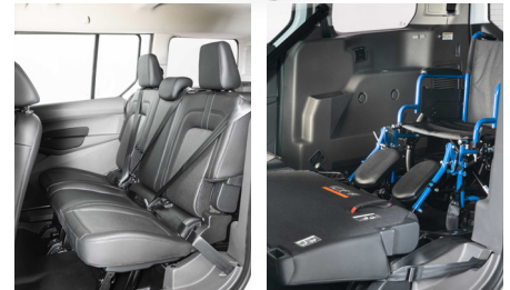
Best Accommodation for a Wheelchair Passenger. The 2nd row split seats allow a wheelchair passenger to see out of the front and the aid to sit in the single seat.