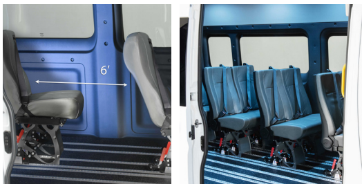
Flexible Seating – With or Without Social Distancing